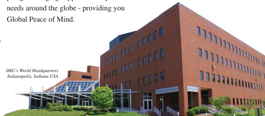
IMG's World Headquarters Indianapolis, Indiana USA

The reasons to travel abroad are many and varied - that's why our products are too.